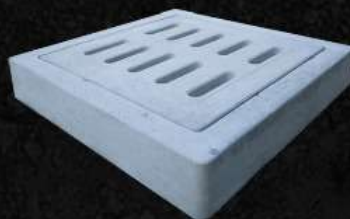
Slotted Drain Cover