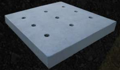
Perforated Drain Covers