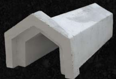
Cable Protection Cover