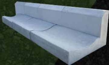
Concrete Kerb Stones