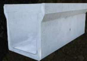
Wet Cast Drains