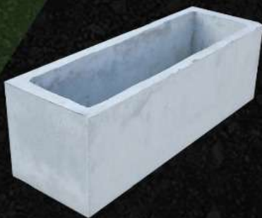
Concrete Planter Box