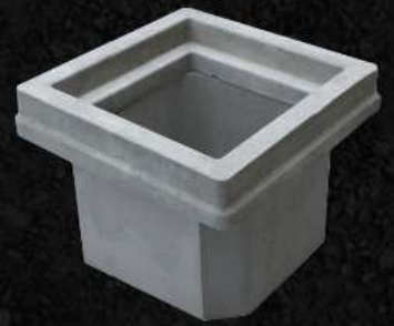
Earth Pit Chamber